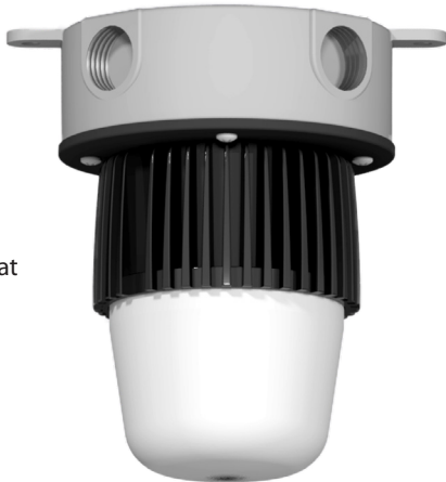
Junction Box Format